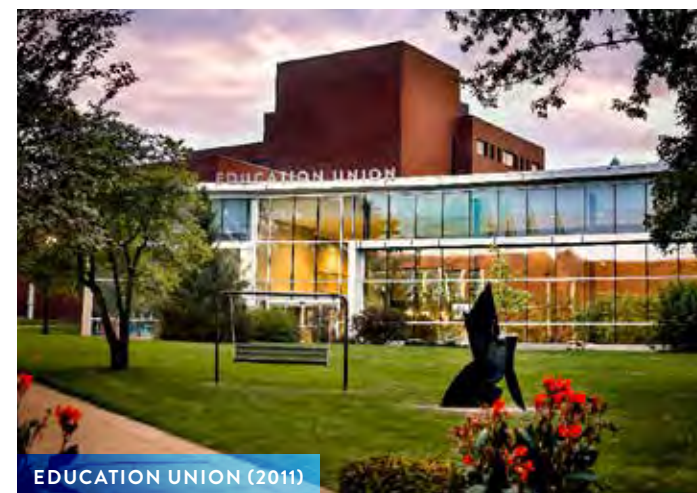
EDUCATION UNION (2011)