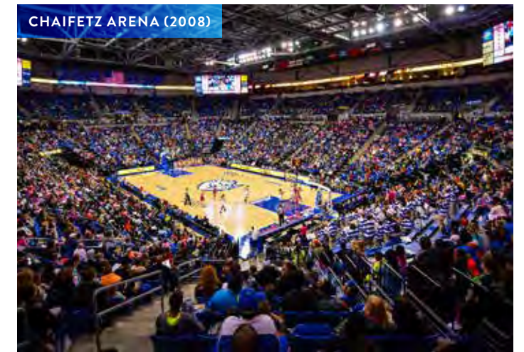
CHAIFETZ ARENA (2008)