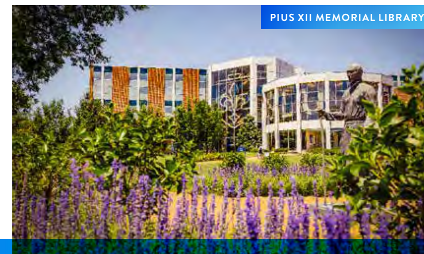
PIUS XII MEMORIAL LIBRARY

The new president will bring genuine enthusiasm for developing the relationships with alumni, friends and community leaders necessary to build and sustain transformational philanthropic investment in SLU. The president will serve as the University's chief storyteller and fundraiser and will play an essential role in developing the strategy for the University's next comprehensive fundraising campaign, linking strategic priorities to philanthropic opportunities to fund current needs and build the endowment.