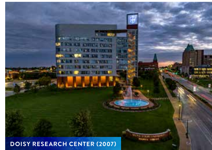
DOISY RESEARCH CENTER (2007)