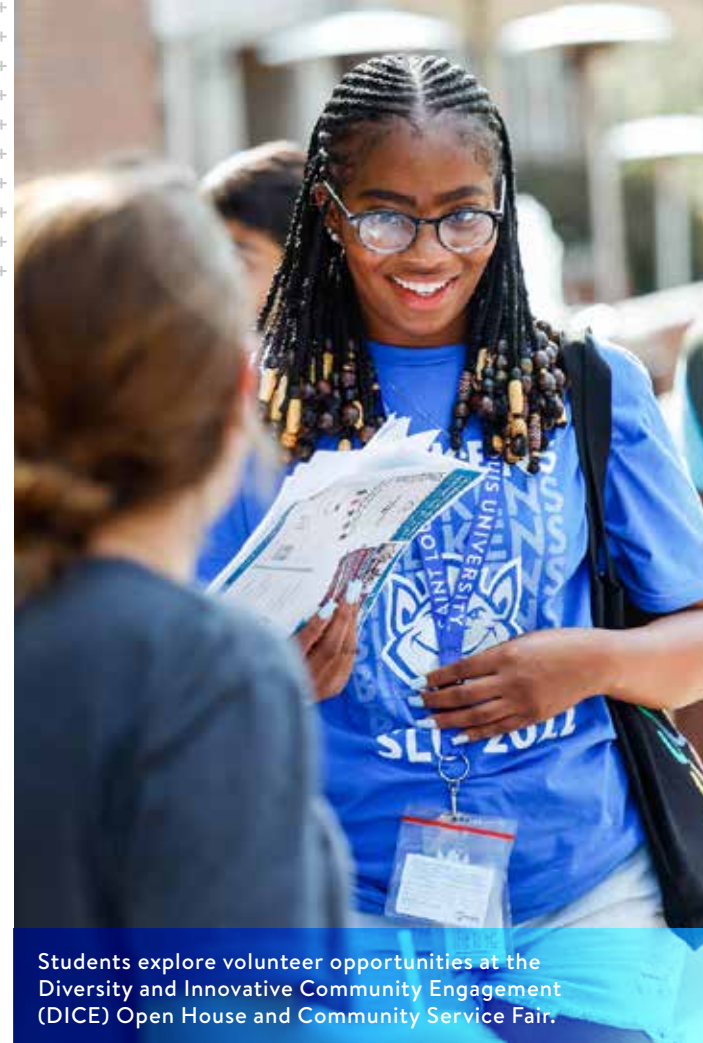
Students explore volunteer opportunities at the Diversity and Innovative Community Engagement (DICE) Open House and Community Service Fair.

The Clock Tower Accords commit the University to actively strengthen diversity, access and equity in pursuit of inclusive excellence on its campuses. In the spirit of the Gospels, the Accords also extend that commitment to its host city of St. Louis and suburban neighbors, particularly the most marginalized and vulnerable communities.