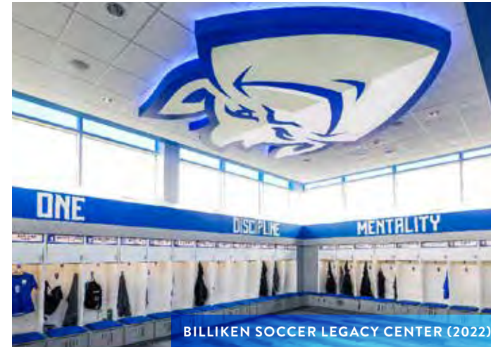
BILLIKEN SOCCER LEGACY CENTER (2022)