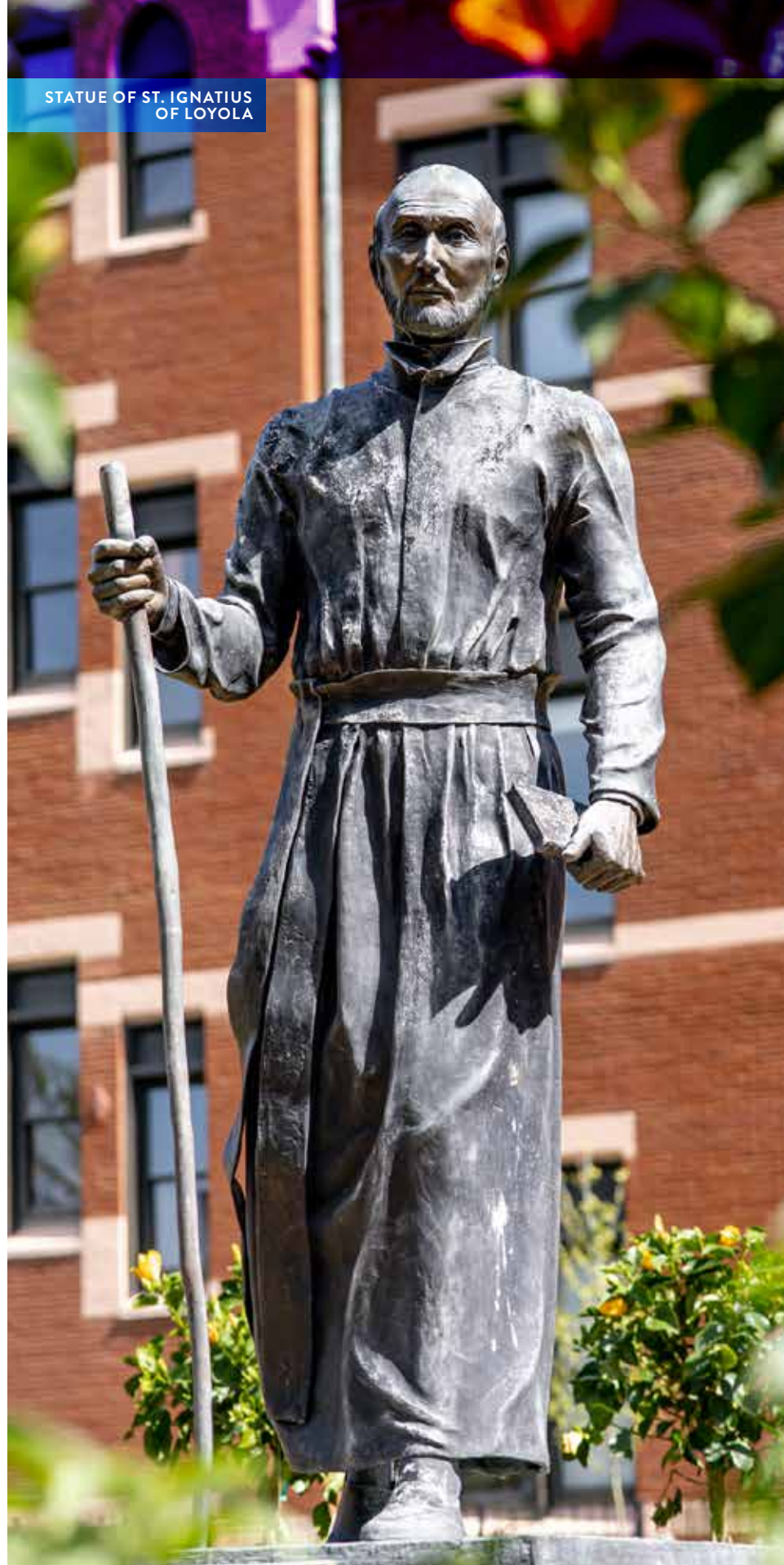
STATUE OF ST. IGNATIUS OF LOYOLA