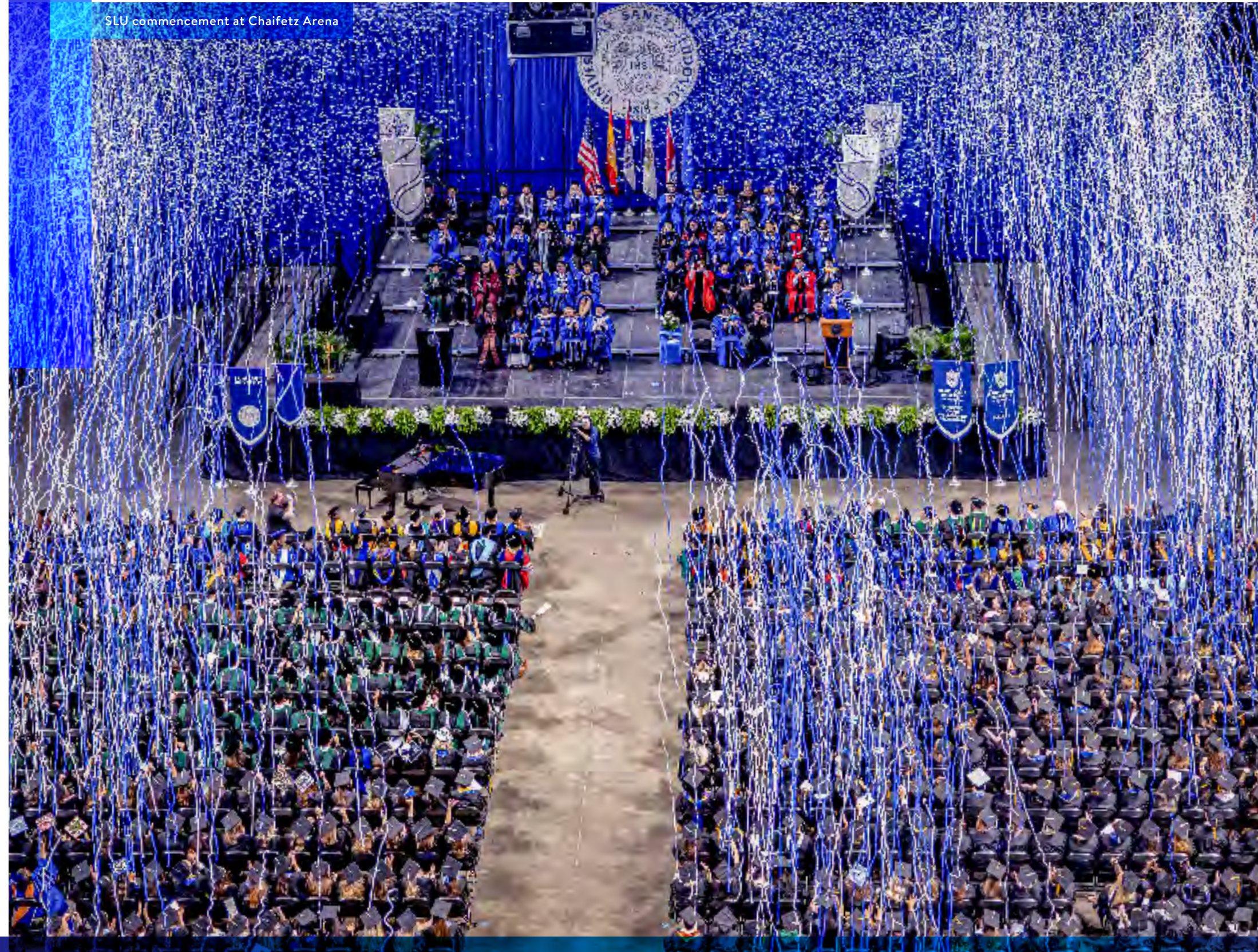
SLU commencement at Chaifetz Arena

Saint Louis University is an equal opportunity/affirmative action employer. All qualified candidates will receive consideration for the position applied for without regard to race, color, religion, sex, age, national origin, disability, marital status, sexual orientation, military/veteran status or other nonmerit factors.