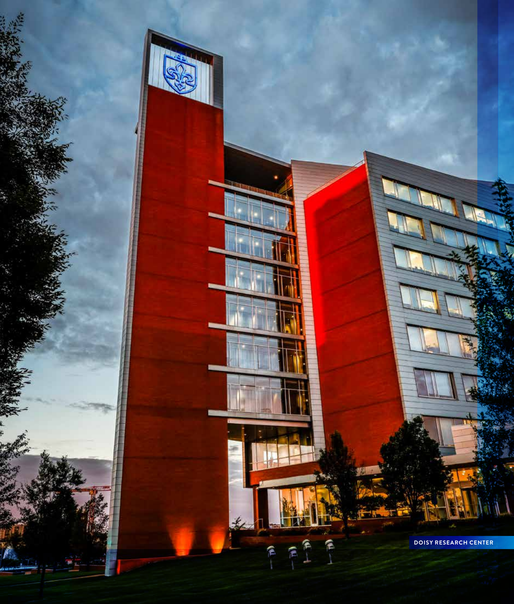
DOISY RESEARCH CENTER