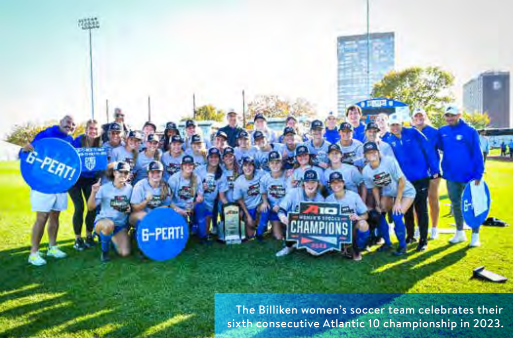
The Billiken women's soccer team celebrates their sixth consecutive Atlantic 10 championship in 2023.