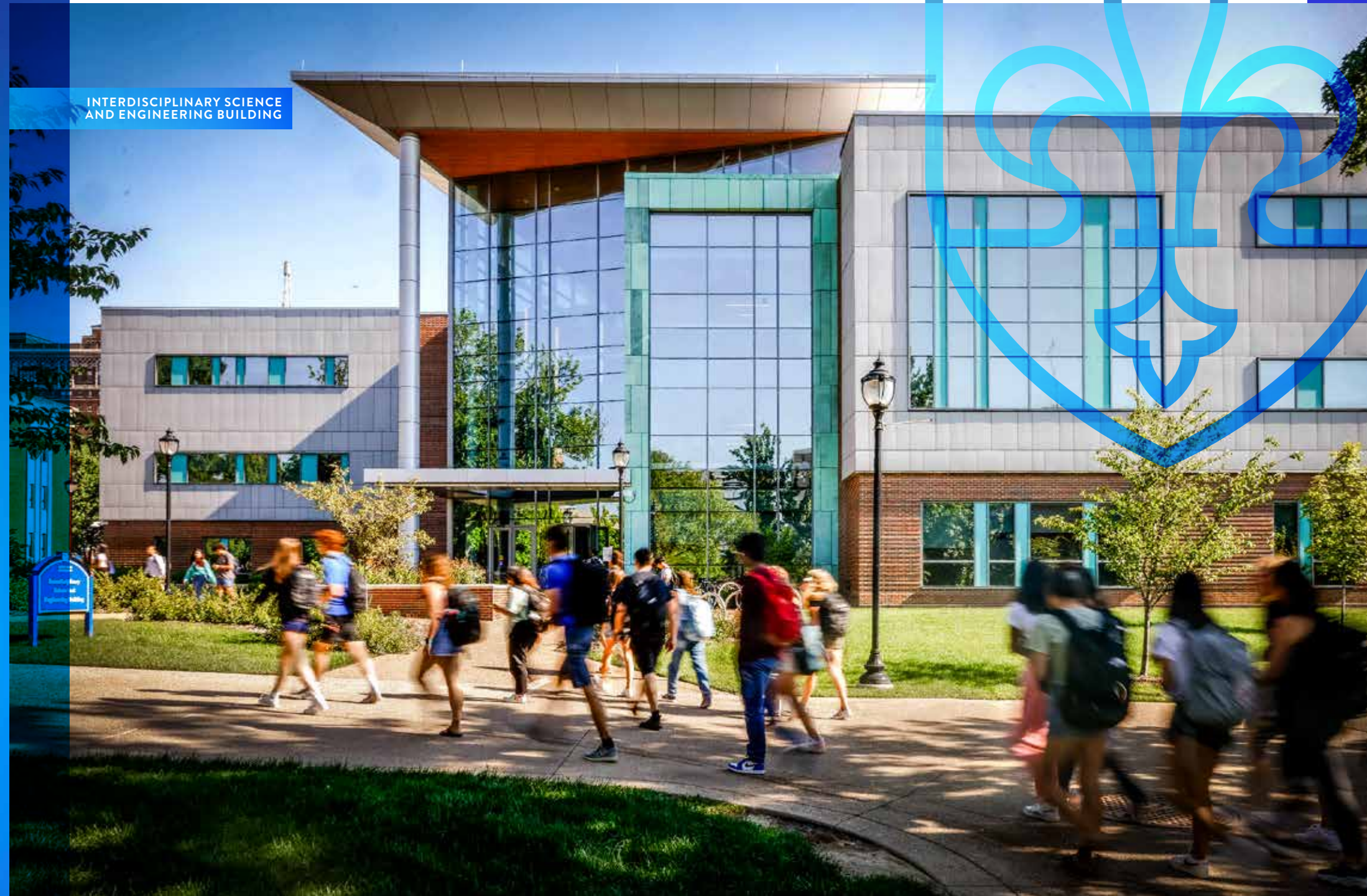
INTERDISCIPLINARY SCIENCE AND ENGINEERING BUILDING

Saint Louis University has a University-wide strategic plan that was launched in 2014 that defines how SLU carries out its responsibilities in a rapidly changing and challenging world. Among its key initiatives are transformative educational and research excellence, health care leadership and innovation rooted in SLU's institutional mission and Catholic, Jesuit values. SLU's academic strategic plan, which launched in 2023, is centered around the goals of teaching and learning; research, scholarship and creative work; community well-being and equity; access and reach; and institutional planning.