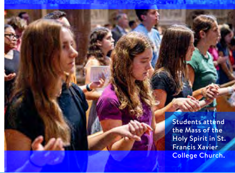
Students attend the Mass of the Holy Spirit in St. Francis Xavier College Church.