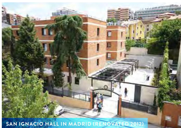
SAN IGNACIO HALL IN MADRID (RENOVATED 2012)