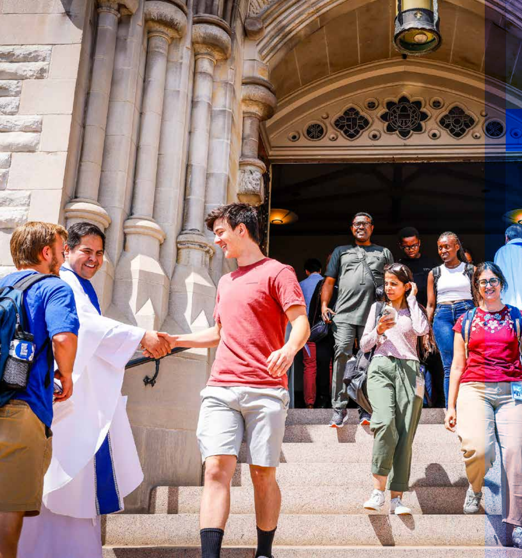
Members of the SLU community exit St. Francis Xavier College Church after celebrating the Mass of the Holy Spirit.