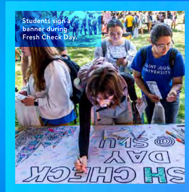
Students sign a banner during Fresh Check Day.

As part of the University's commitment to supporting the mental health and well being of its students, SLU is proud to be an official JED Campus. In partnership with the Jed Foundation, a leading non-profit organization dedicated to helping universities evaluate and strengthen their mental health, substance misuse and suicide prevention programs, SLU is working to foster an even stronger culture of well being, hope and resilience on its campuses and among its students. More than 1,250 members of the SLU community also have been trained in Mental Health First Aid.