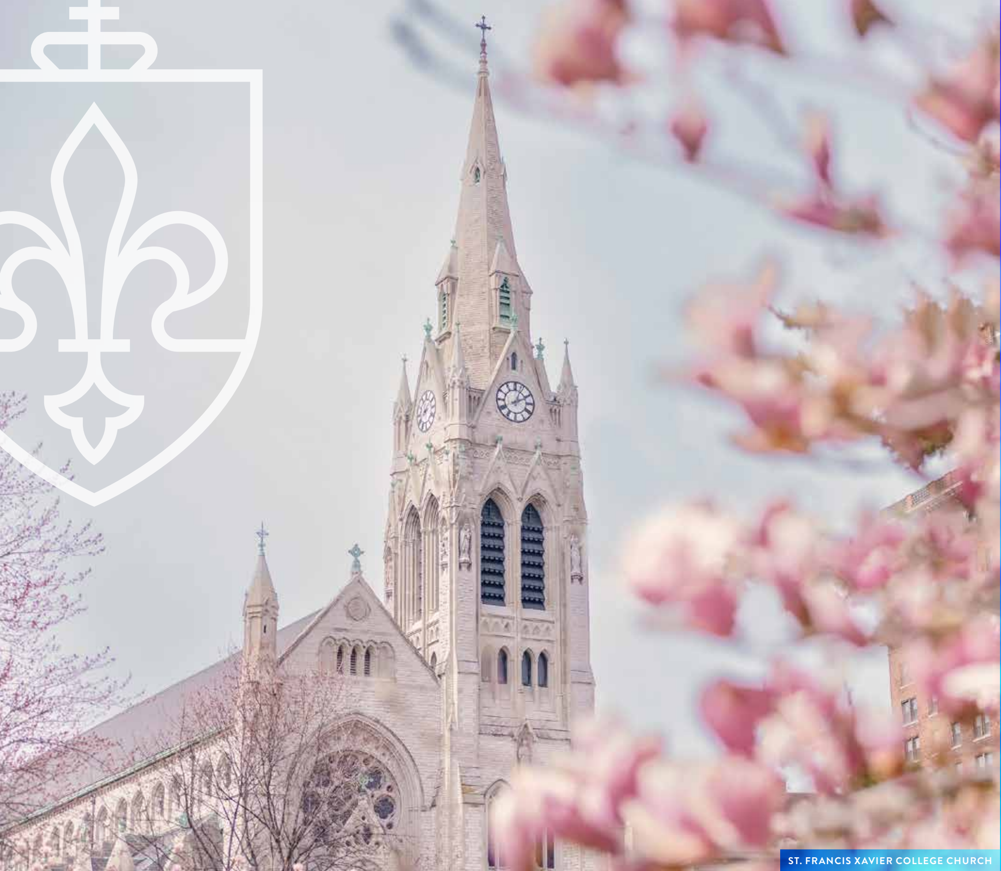
ST. FRANCIS XAVIER COLLEGE CHURCH