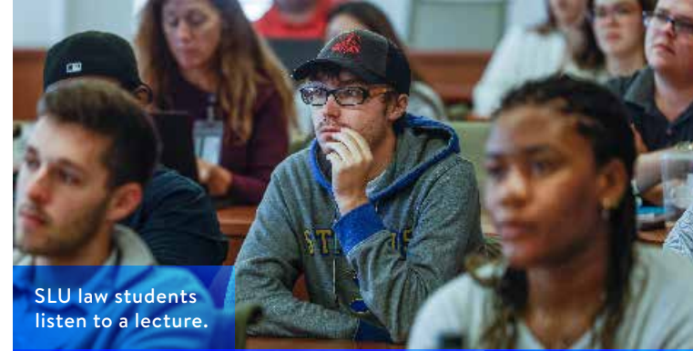
SLU law students listen to a lecture.

At present, SLU has more than 500 sites for volunteer opportunities and service learning, and 80% of SLU students volunteer each year. In 2023, more than 40,000 meals were prepared and delivered to those in need by nearly 3,000 volunteers through SLU’s Campus Kitchen.