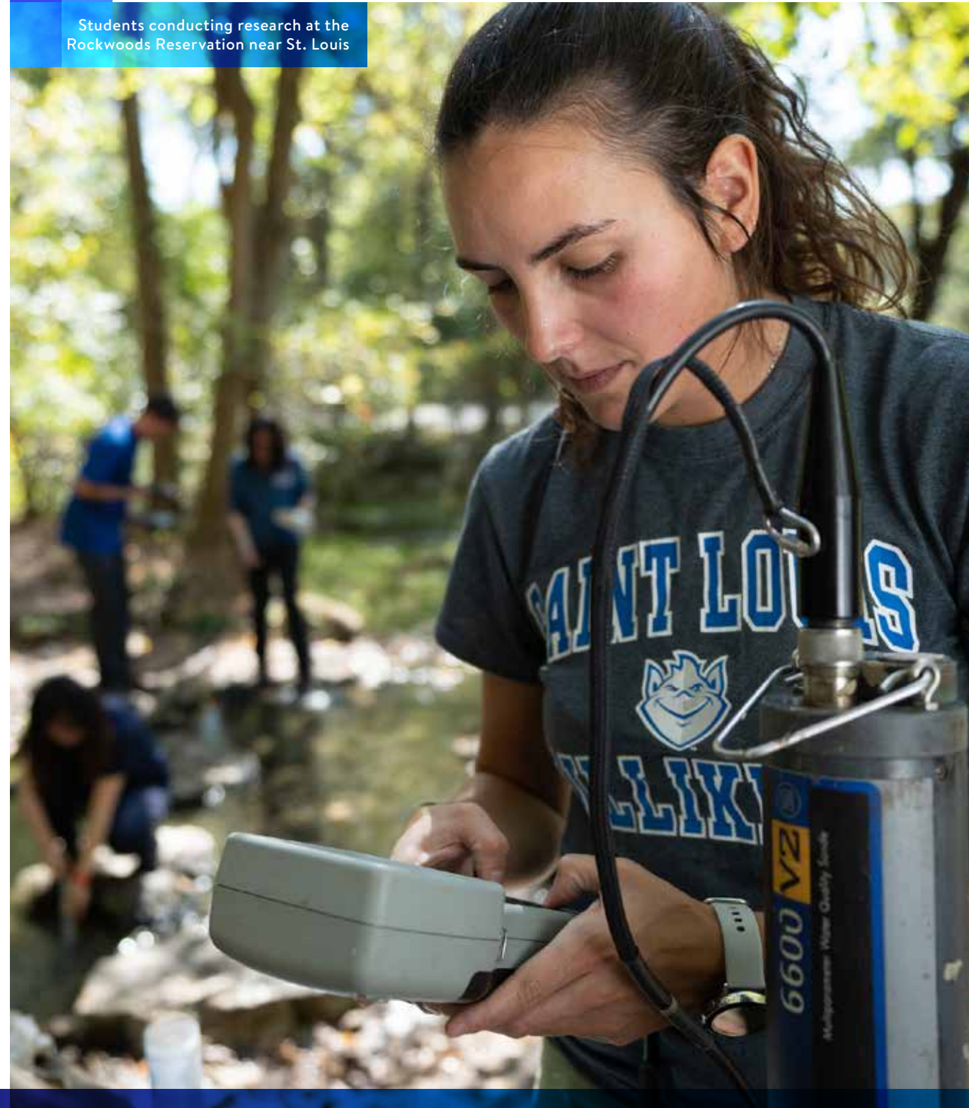
Students conducting research at the Rockwoods Reservation near St. Louis