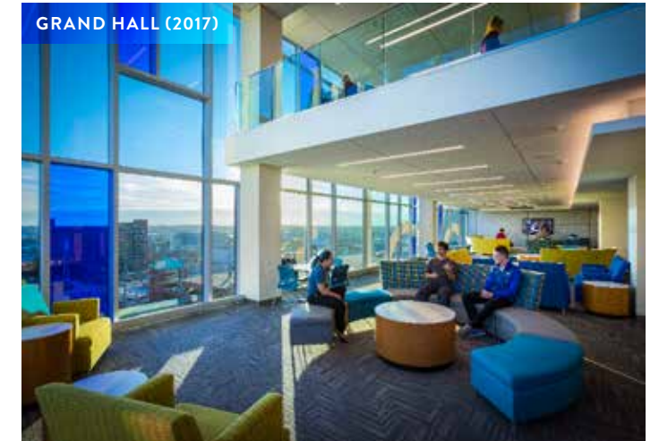
GRAND HALL (2017)