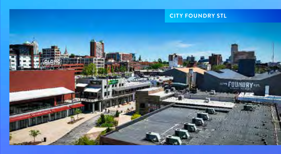
CITY FOUNDRY STL

This effort has led to the renaissance of SLU's neighborhood, which is home to more than $1.2 billion in new housing, retail and business development. Topgolf, City Foundry STL dining and retail space, Alamo Drafthouse movie theater, the Armory entertainment venue and an Element hotel are just a few of the recent additions to Midtown. A new Target store is slated to open in 2024.