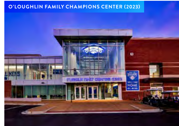
O’LOUGHLIN FAMILY CHAMPIONS CENTER (2023)