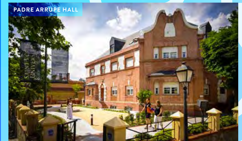
PADRE ARRUPE HALL