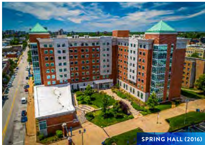
SPRING HALL (2016)