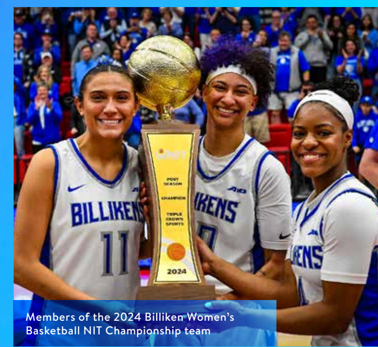
Members of the 2024 Billiken Women's Basketball NIT Championship team