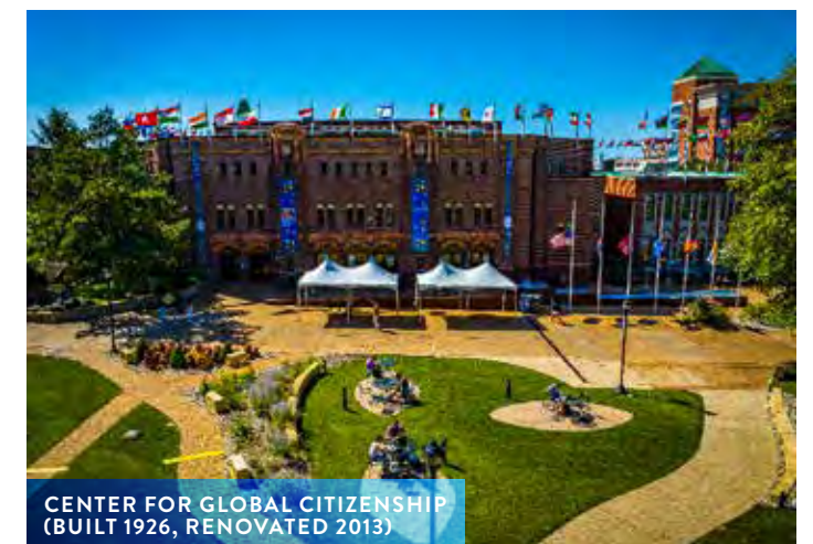
CENTER FOR GLOBAL CITIZENSHIP (BUILT 1926, RENOVATED 2013)