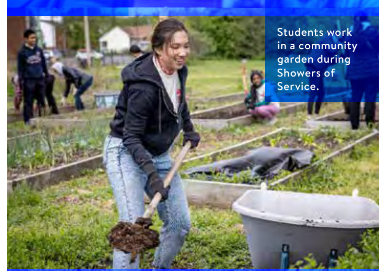
Students work in a community garden during Showers of Service.