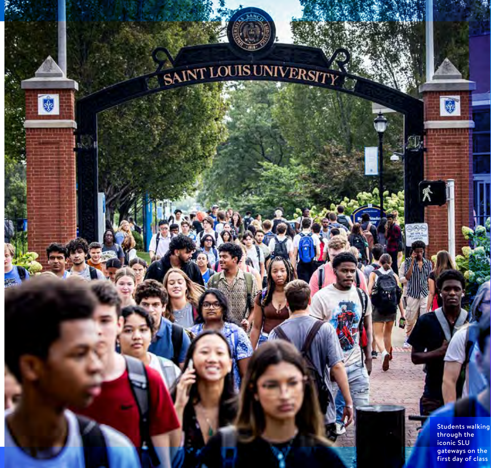
Students walking through the iconic SLU gateways on the first day of class