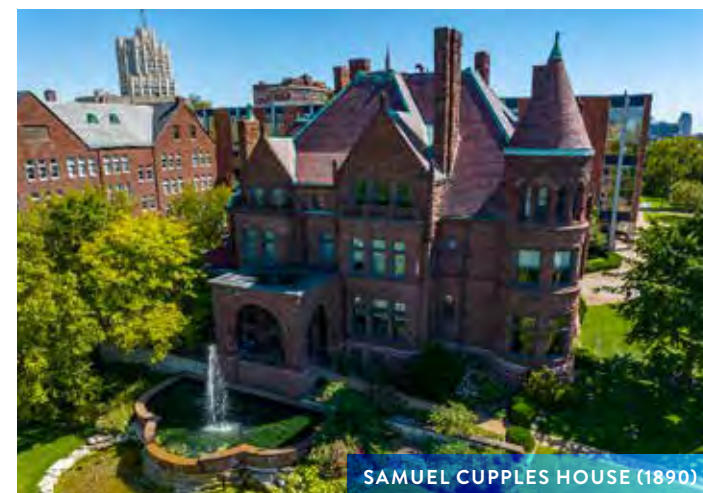
SAMUEL CUPPLES HOUSE (1890)