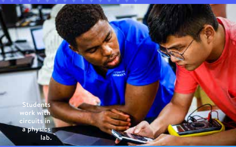
Students work with circuits in a physics lab.