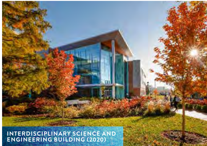
INTERDISCIPLINARY SCIENCE AND ENGINEERING BUILDING (2020)